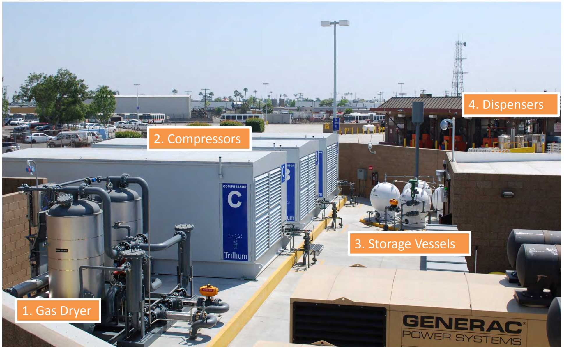
1. Gas Dryer