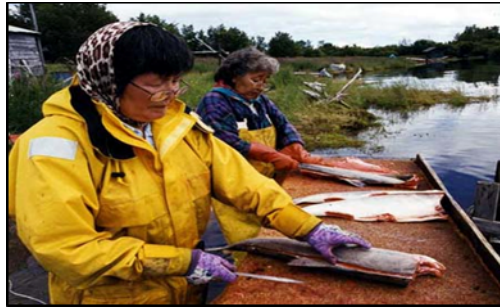
Unique Exposure Pathways