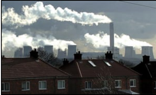
Proximity and Exposure