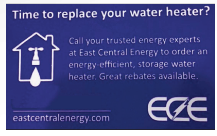
FIGURE 4:East Central Electric Water Heater Sticker

Educate any local plumbers or other relevant contractors your co-op works with about your program so that they can educate their customers.