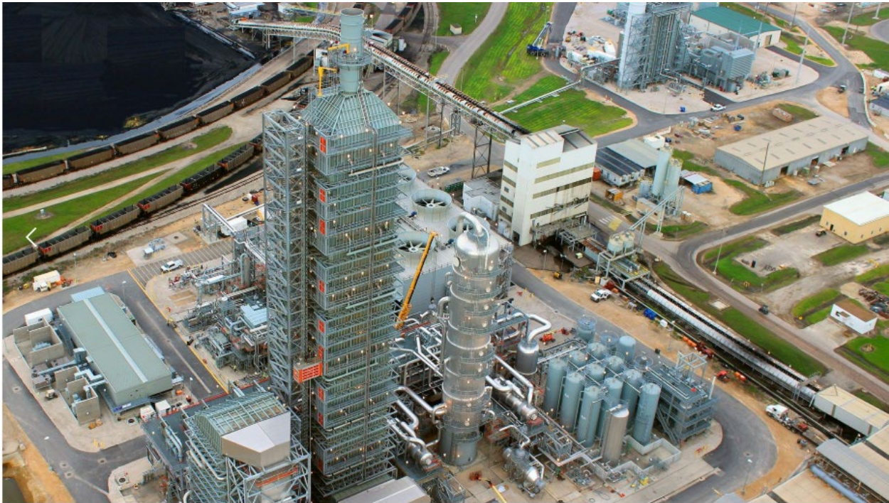
Exhibit 2-3. Petra Nova CCS (Thompsons, Texas) – operations began in 2017

Internationally, DOE continues to support U.S. scientist participation to advance research in carbon storage. In Saskatchewan, Canada, the Aquistore project started injection into a deep saline reservoir in 2015. Aquistore is an integral component of SaskPower's Boundary Dam Integrated CCS Demonstration project, which involves post-combustion capture from a coal-fueled power plant and transport via pipeline to an oilfield for EOR, with additional saline